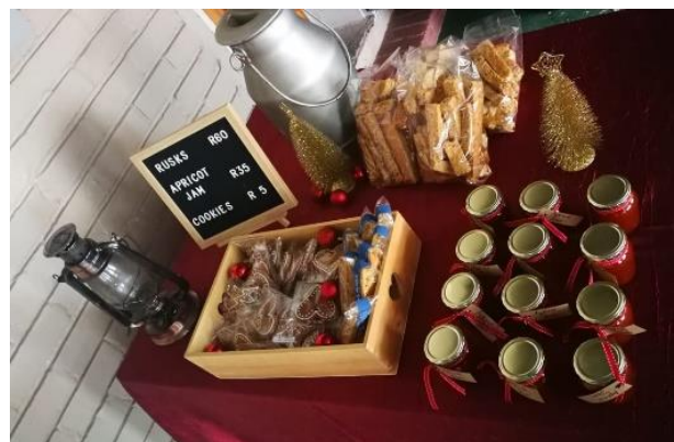
Plus, plenty of home-made goodies for sale