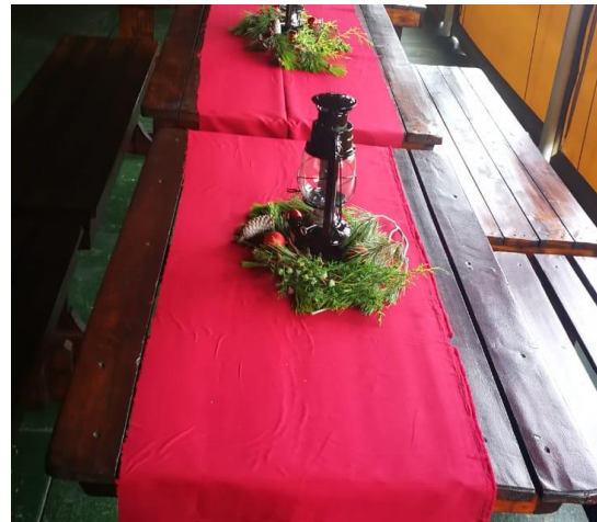
The benches decorated to give a bit of Xmas cheer to the event.

Please note: If a order is placed + no show your will be liable to still pay the full amount