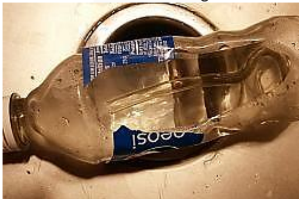
Formed and in boiling water note the drink bottle deforming