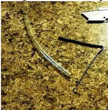
Tubing and tool before forming.