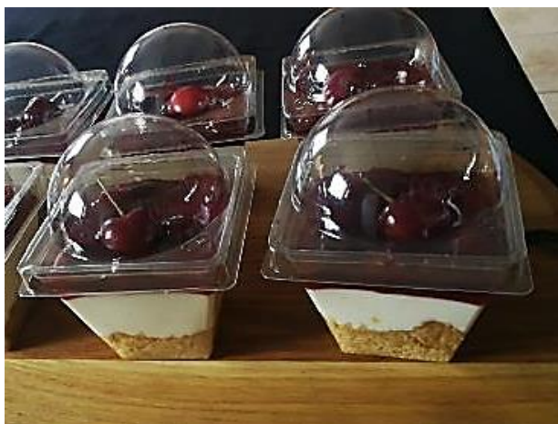
....and the Black Cherry Cheesecake was to die for