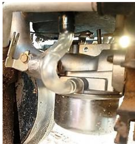
Installed on the engine

I hope this helps someone if they ever find the need to form plastic tubing.