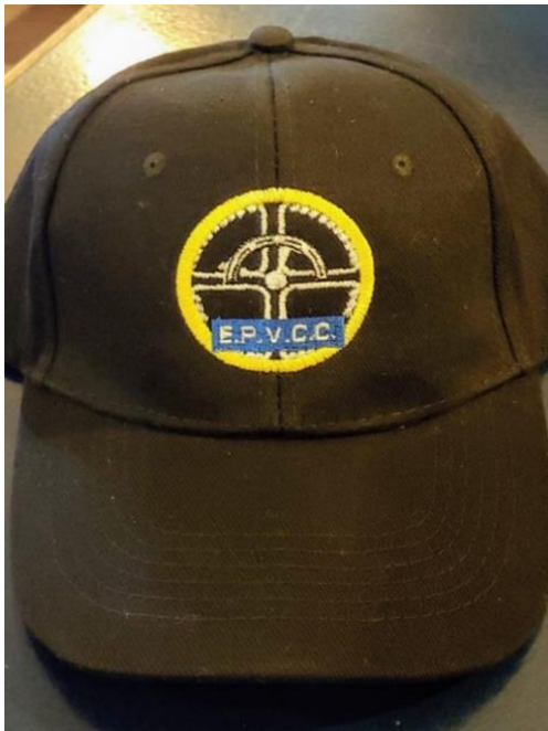
EPVCC Caps will be available on Friday night from Devlin when the club re-opens. R100 per cap.

The committee trusts that this will add additional value to your membership.