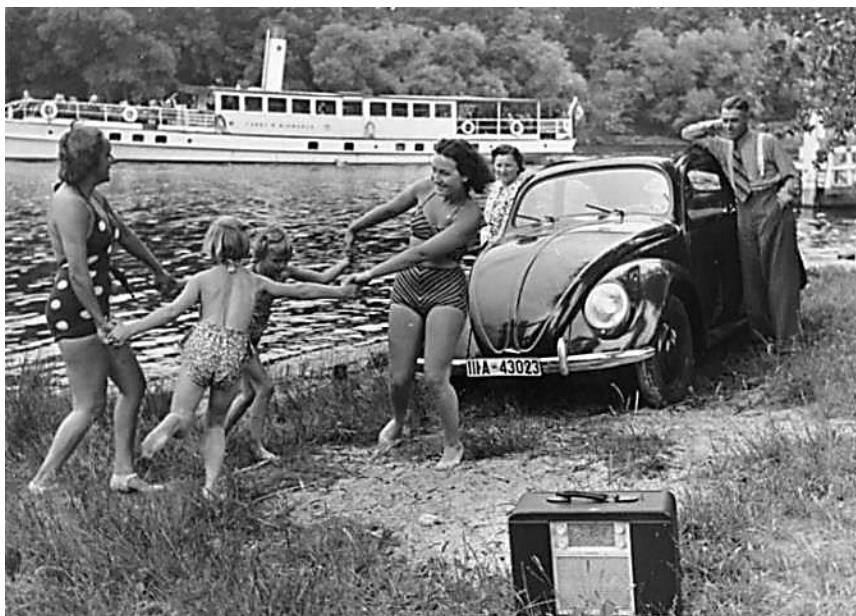
A family playing by a river with a KdF-Wagen and radio receiver

The repair work was often hampered by a lack of spare parts and many times these had to be either improvised or made from scratch.