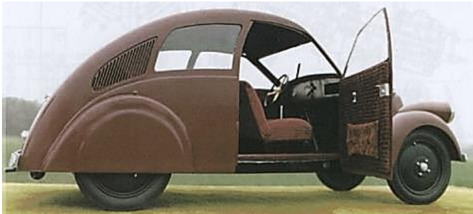
An early Volkswagen Beetle. 1932 Porsche Type 12.

However, the story might have been completely different had it not been for British Army officer Ivan Hirst.