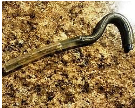
Tubing now formed and cooled