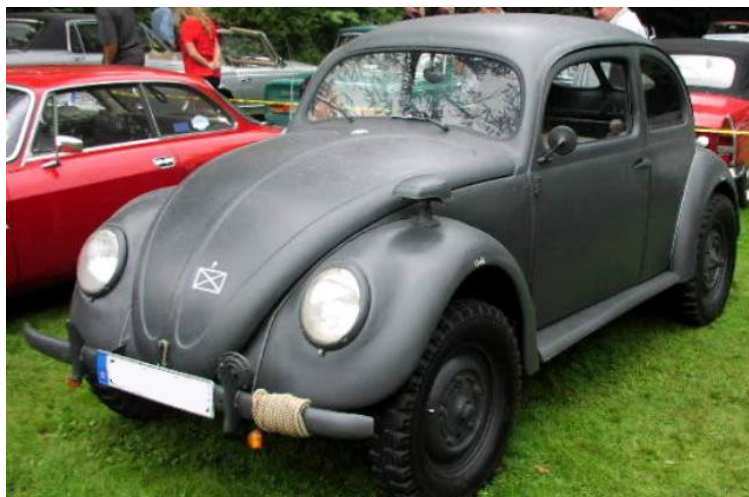
Type 82E—Kübelwagen chassis Beetle body.