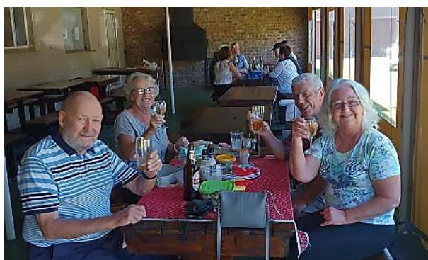
....now time to relax