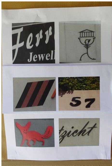
Some of the clues.....

a pen and a clipboard a reasonable sense of direction good powers of observation a little lateral thinking a good sense of humour the ability to write legibly in a moving car.